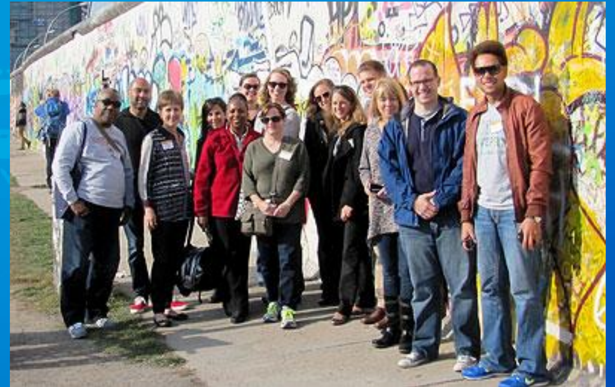
2014-2015 IEA Group to Germany