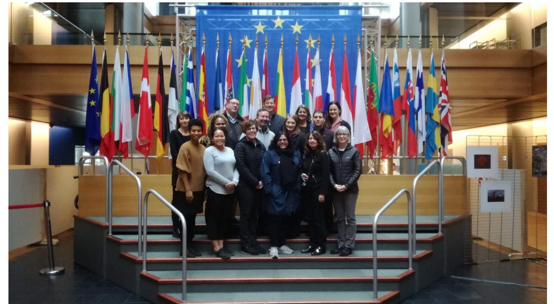
In 2019, seminar group met in Karlsruhe and visited European Parliament in Strasbourg.