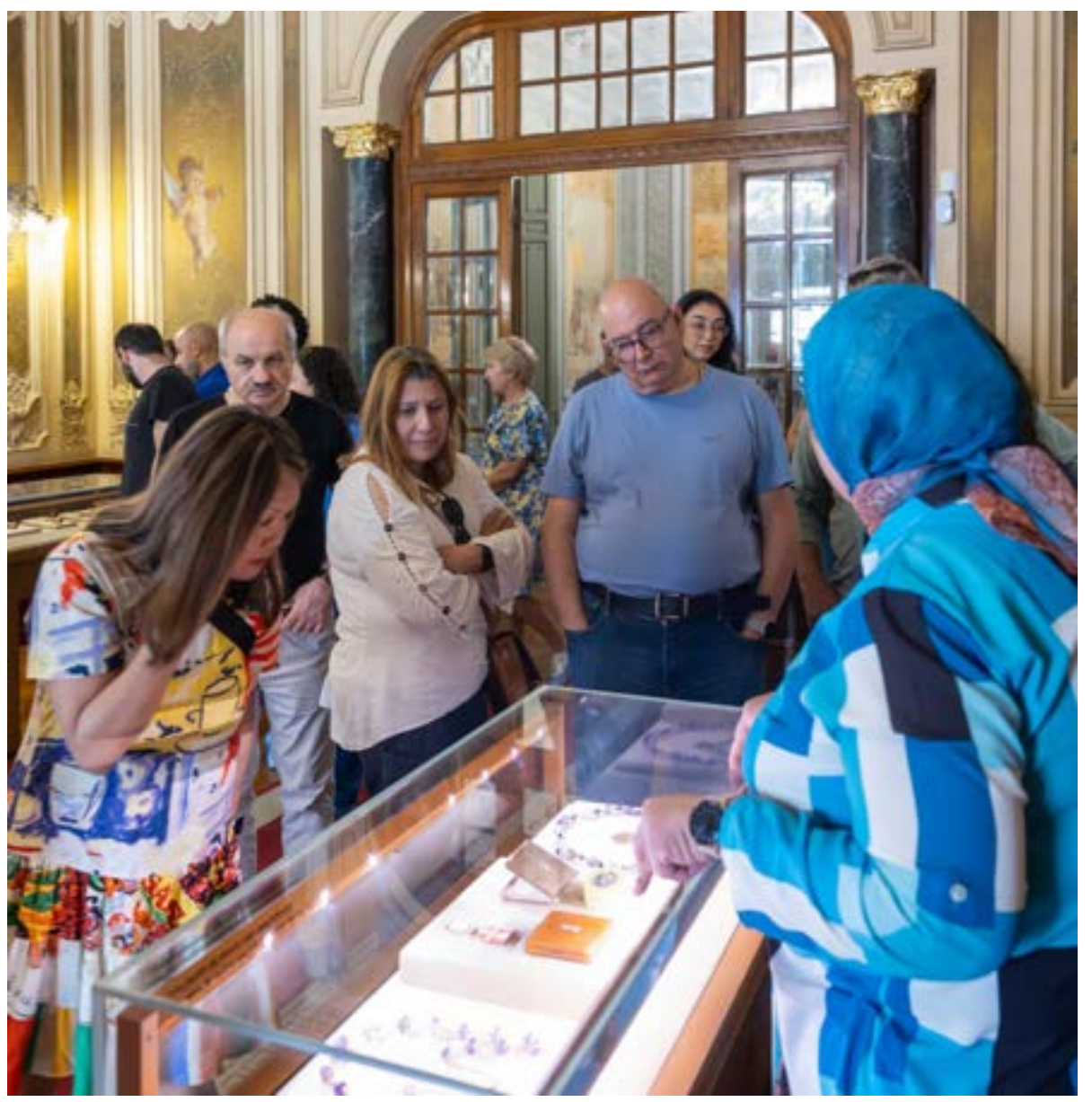
Fulbright U.S. Grantees in Alexandria