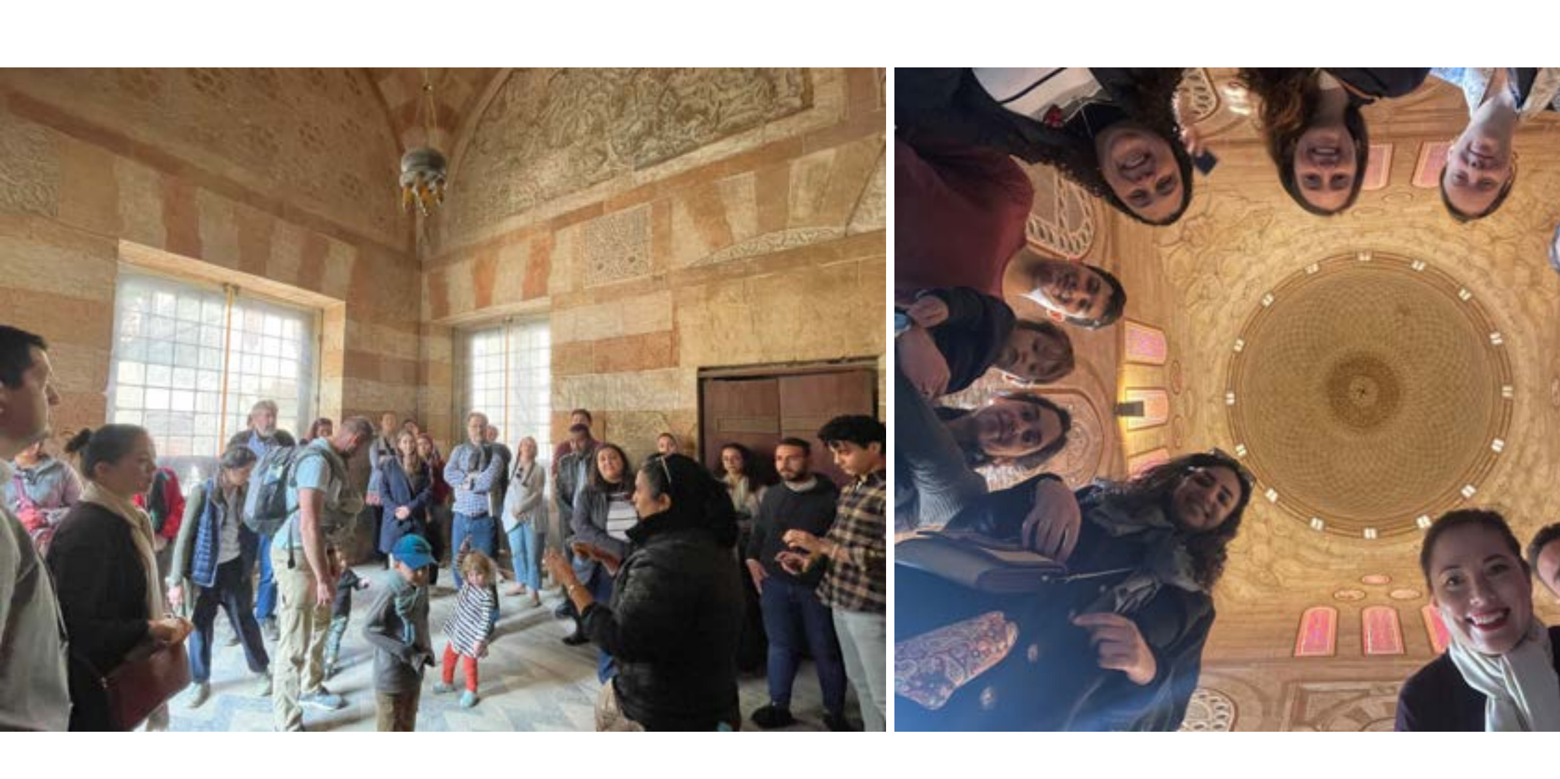
Tour of Al-Darb Al-Ahmar, Old Cairo