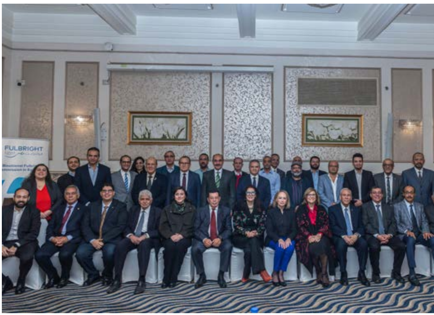
Networking Event for Fulbright U.S. Scholar