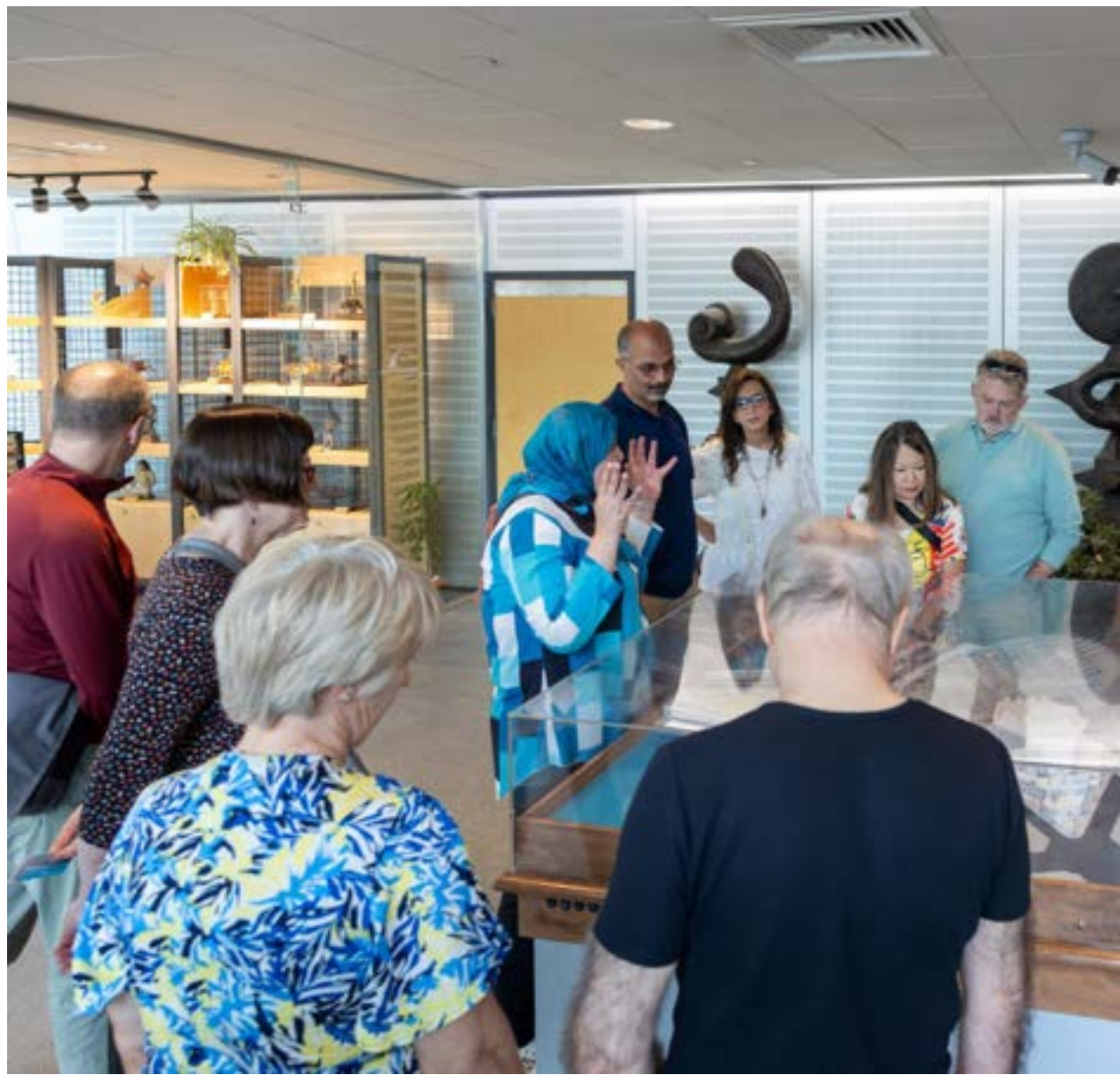
Fulbright U.S. Grantees at the Bibliotheque Alexandrina, Alexandria