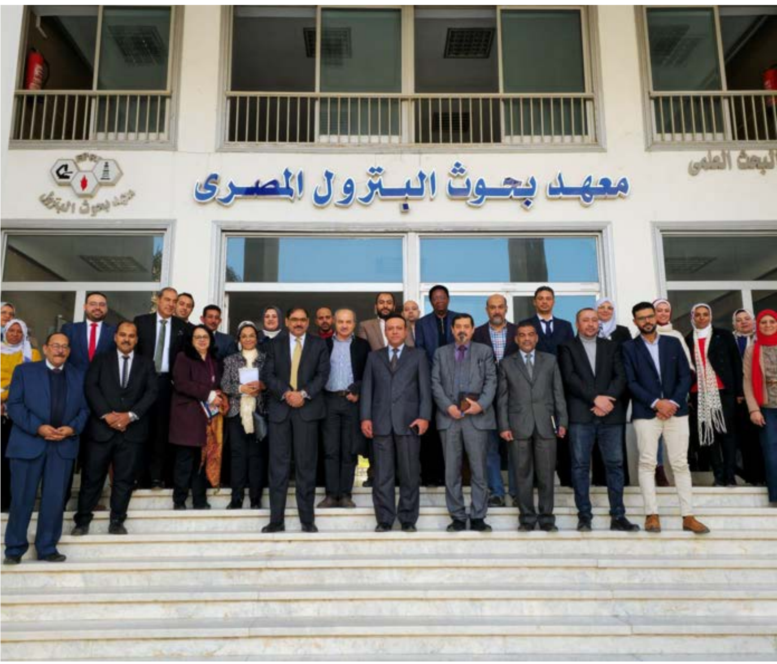
Networking Event for Fulbright U.S. Scholars