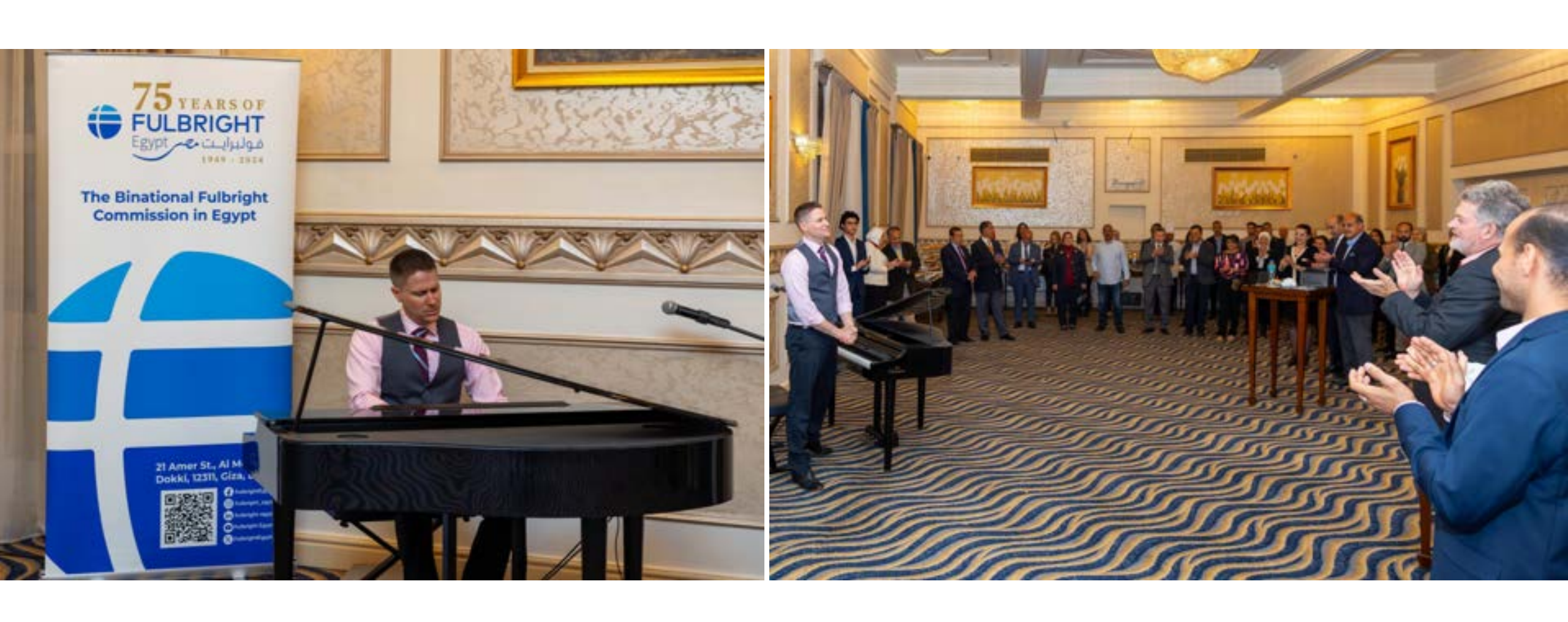
Fulbright U.S. Grantees at an Alumni Event