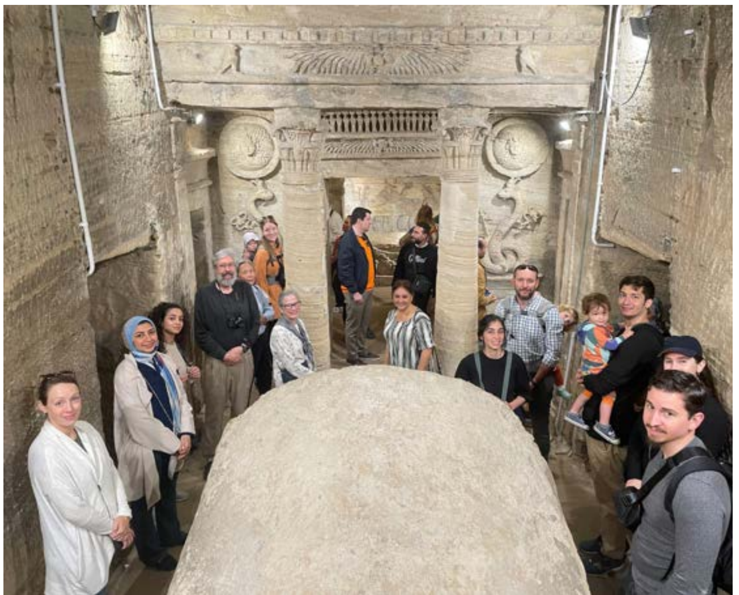
Fulbright U.S. Grantees in Alexandria