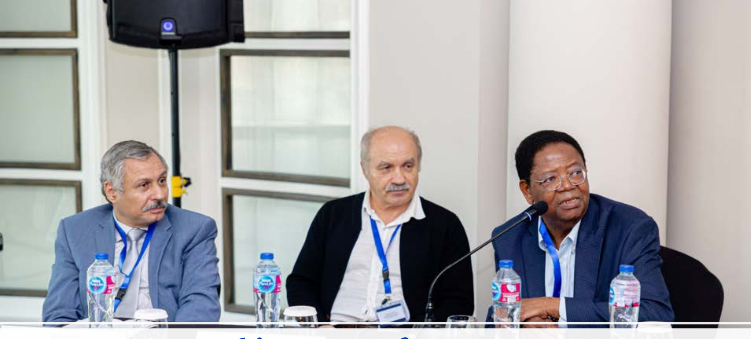
Networking Events for U.S. Grantees