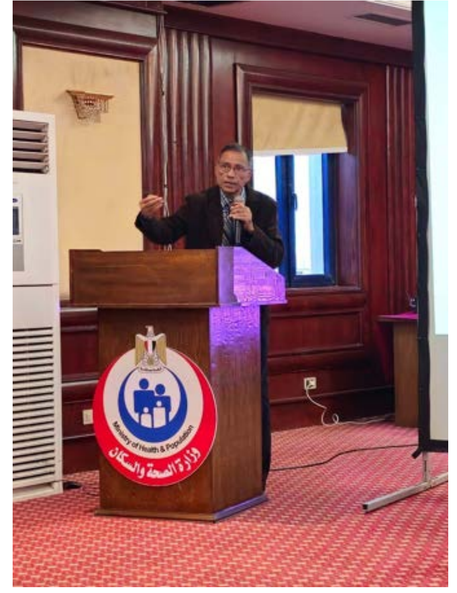
Networking Event for Fulbright U.S. Scholar