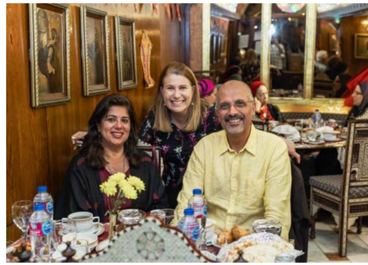
Fulbright U.S. Grantees at a Ramadan Iftar in Khan Al-Khalili, Islamic Cairo