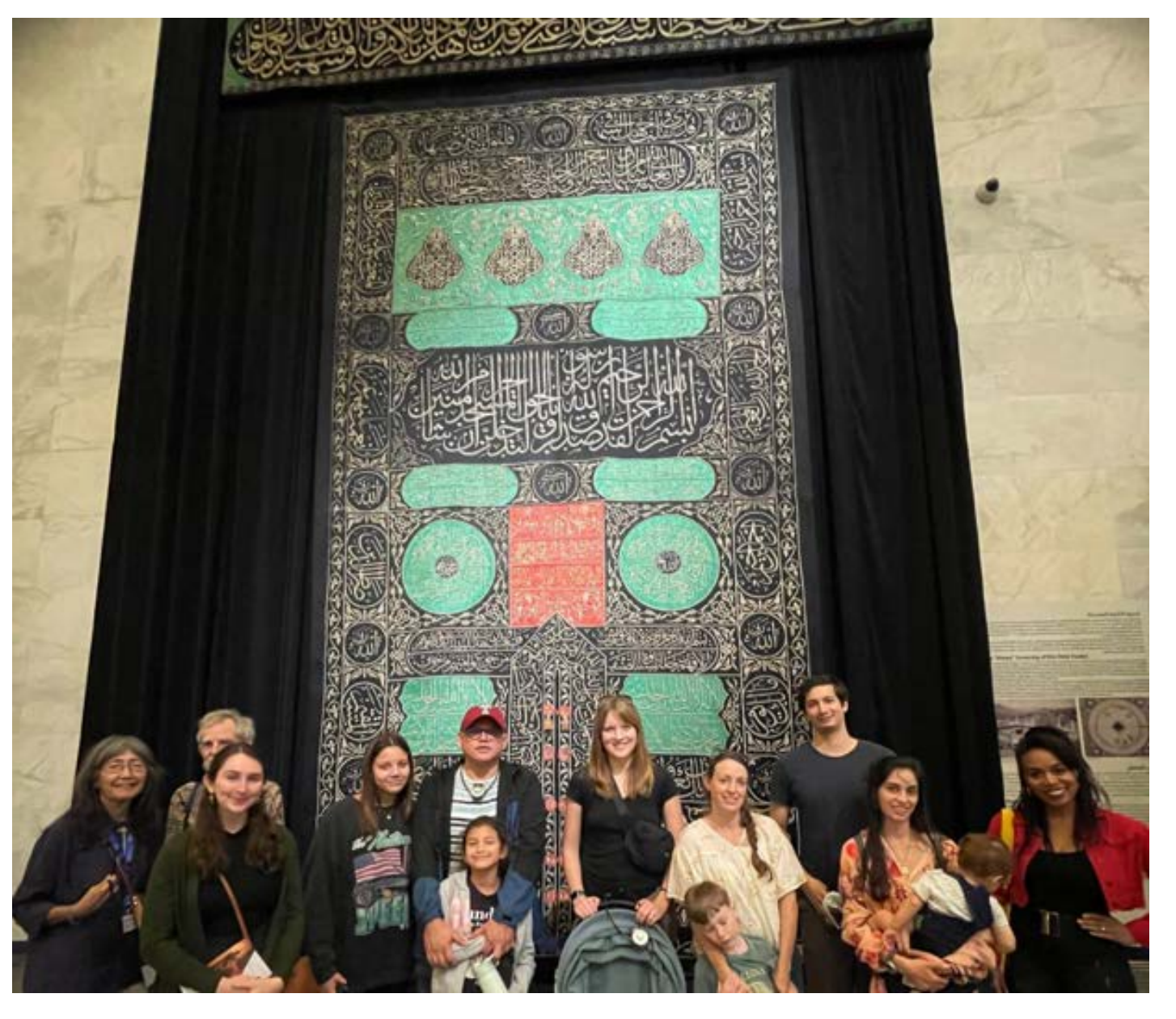
Visit to the Museum of Egyptian Civilization