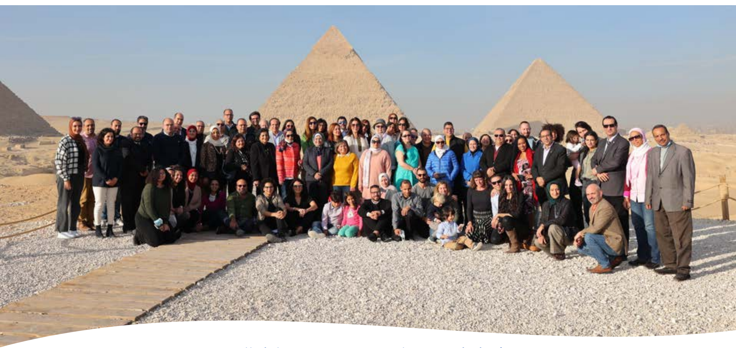
Fulbright U.S. Grantees at the Commission's Christmas Party at the Pyramids