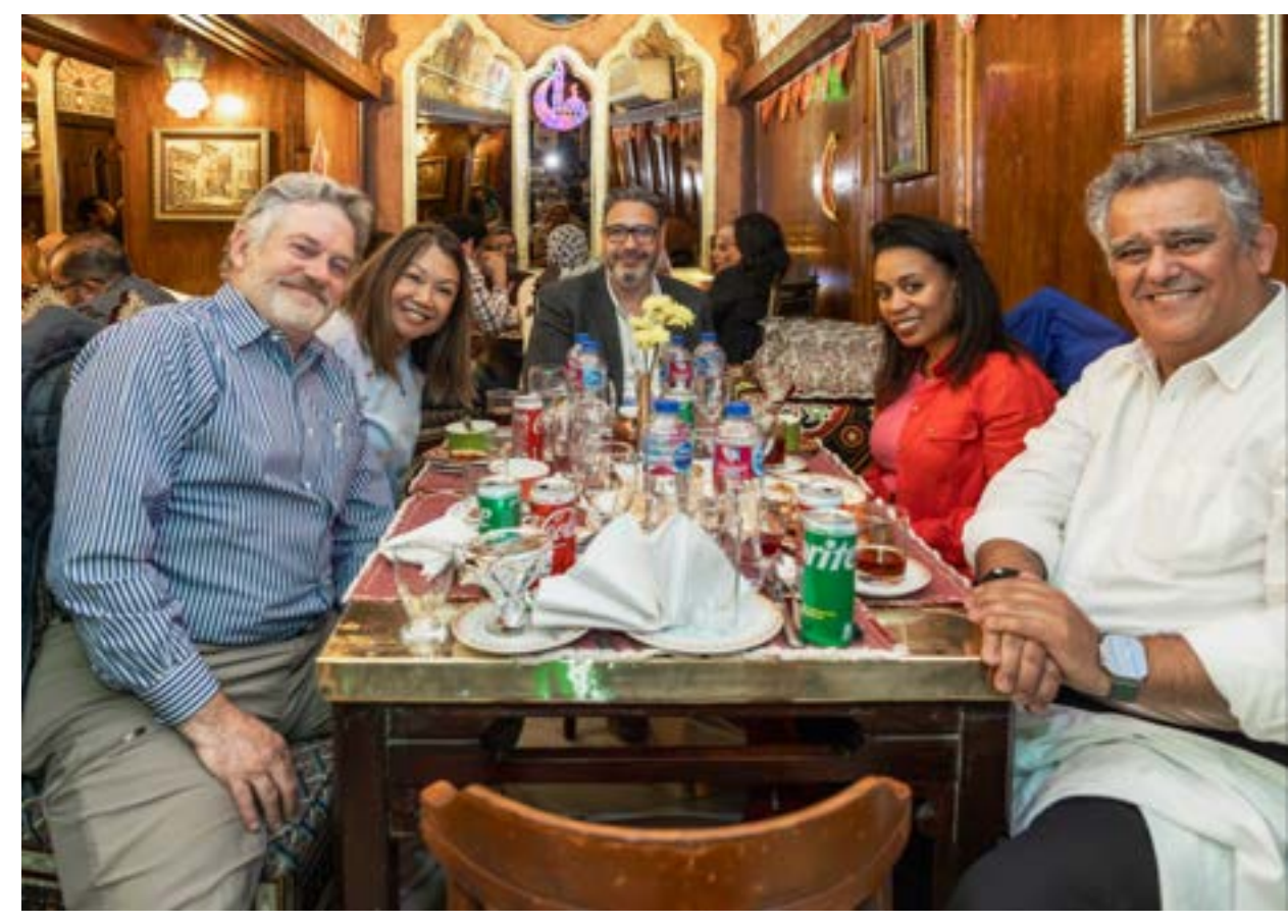
Fulbright U.S. Grantees at a Ramadan Iftar in Khan Al-Khalili, Islamic Cairo