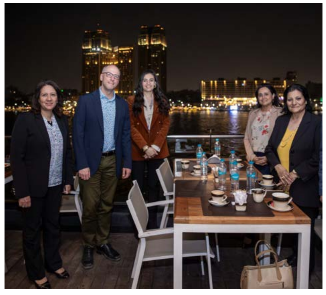
Fulbright Alumni and U.S. Grantees at a Ramadan Iftar by the Nile