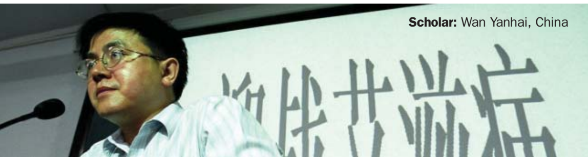
Scholar: Wan Yanhai, China